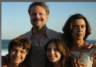
I'm Still Here