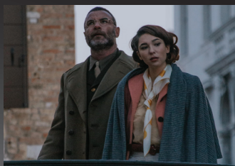
Across the River and Into the Trees