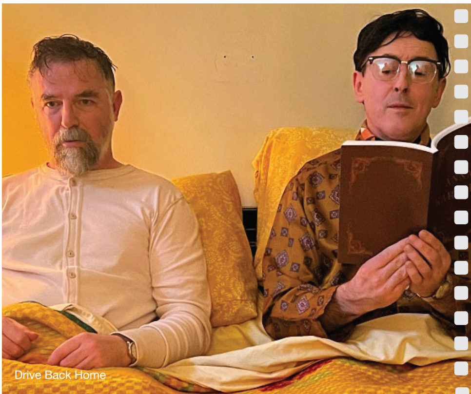
Drive Back Home

Theatre: Salmar Classic (360 Alexander St., Salmon Arm)