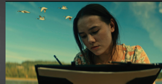
Can I get a Witness