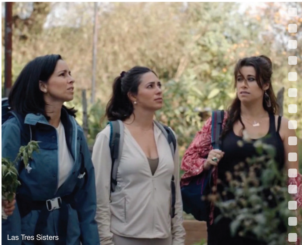
Las Tres Sisters