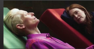
The Room Next Door