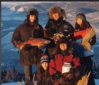
First We Eat