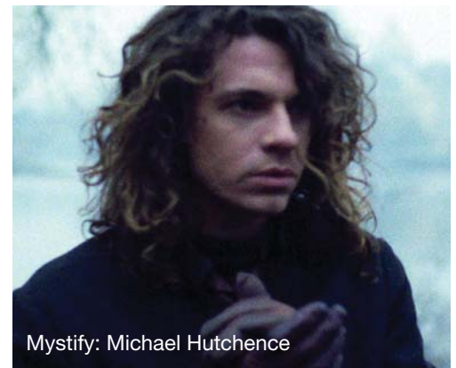
Mystify: Michael Hutchence