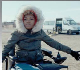
Give Me Liberty