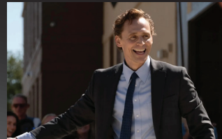
The Life of Chuck