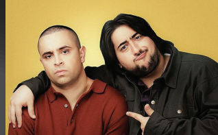
Please After You