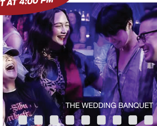
THE WEDDING BANQUET